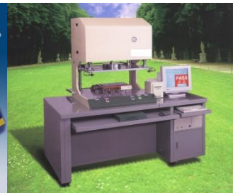
UTRON PCB TEST SYSTEM