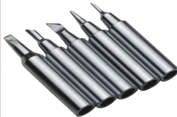
SOLDERING BITS (HAKKO/WELLER)