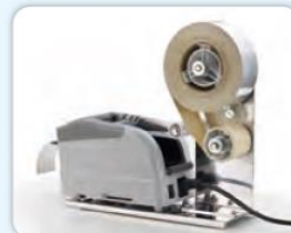
ZCUT-9GRRP Cut a tape with backing paper while removing it